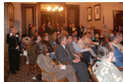
Welcome in the Speaker's Library.

The day was very informative and worthwhile, not only for those attending, but also for making our state legislators more aware of people with hearing loss and the issues that are important to us. If you have not attended a Day at the State Capitol, you should plan on doing so next year.